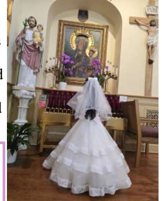
Pictured: Students from Our Lady of the Hamptons School at their First Holy Communion Mass at Our Lady of Poland.

The 2026 Bucks for Books drive at OLH has struggled to meet the goal amid snow storms and the economy. Hopefully the end is in sight and the school wants to reward some lucky ticket hold with the $10,000 in the next few weeks. If you would like to support OLH and possibly win that prize, please contact the school at 631-283-9140.